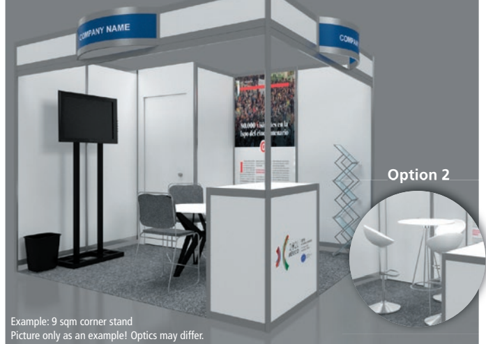
Example: 9 sqm corner stand Picture only as an example! Optics may differ.