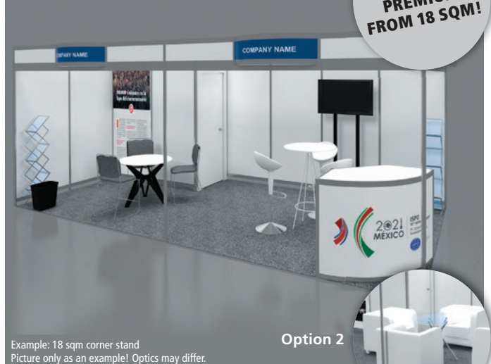
Example: 18 sqm corner stand Picture only as an example! Optics may differ.